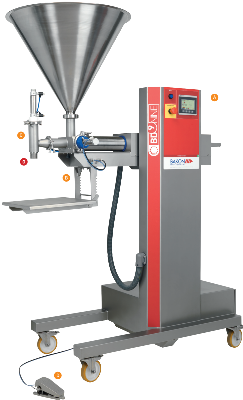
A Full-colour touch screen for storing parameters and recipes